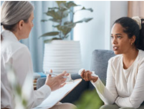
A Proposed Rule to Make Mental Health Parity a Reality