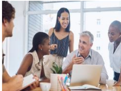
Promoting Mental Health-Friendly Workplaces — for Everyone