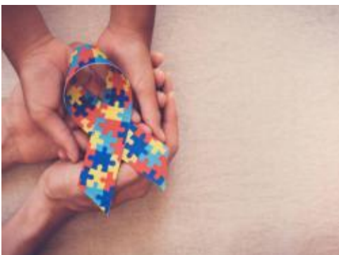
Respecting and Enforcing Autism Benefits